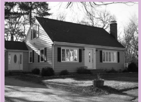
Home Sweet Home: Woodcrest facade.