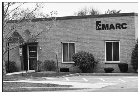
2 Ray Avenue: Facade of Life Choices Central Middlesex in Burlington.