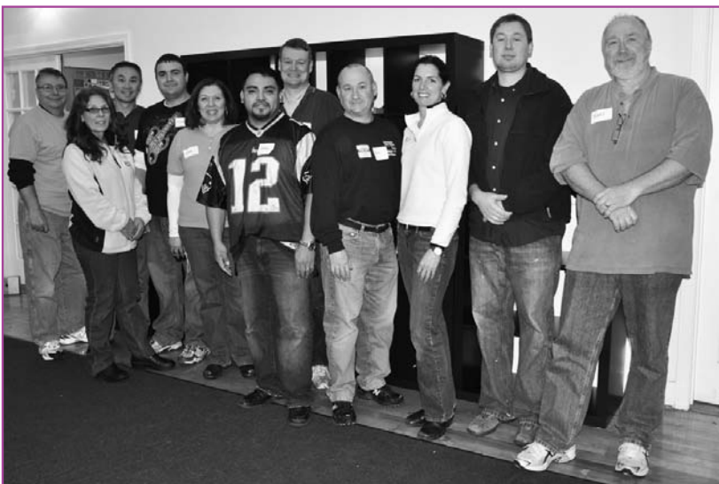
Our Stars: East Boston Saving Bank staff volunteered on a Saturday to help assemble the furniture that will display the custom designs of our talented Center for Emerging Artists participants.

On Saturday, December 11, a crew of volunteers from